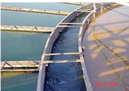
Water from the Chao Phraya River flows through a clarifier and a filter at the Bangkhen water treatment plant.