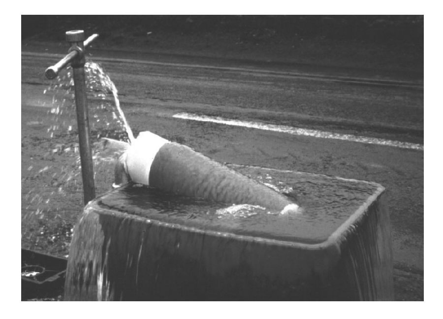
Plate 6.1. Sampling animals and loose deposits in a fine-meshed sampling net.